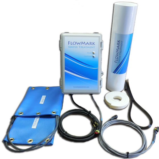
Nema 4X Treats 3-4" Dual Wall HDPE Pipes