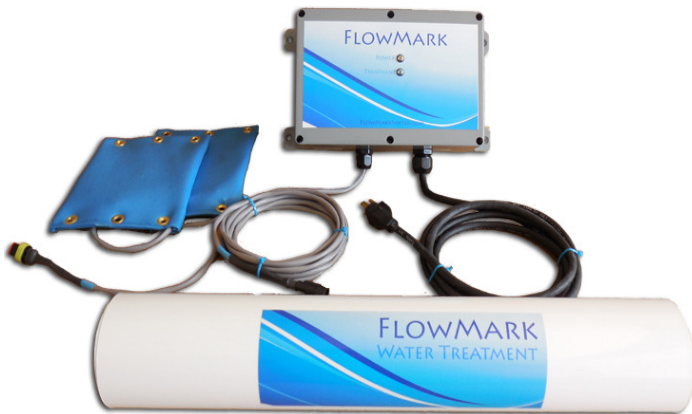
FLOWMARK MODEL MARK-II-DS