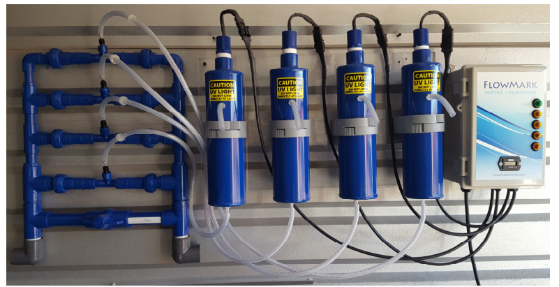
Replaceable Lamp Life = 1 Year (9,000 hrs.)